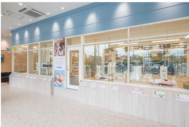
PET PLUS Store in COTOE mall Nagareyama Ootakanomori.

“Adding to that, we also encourage pet owners to keep their animals on slip resistant floors for their health and safety. We find it easier to communicate the importance of this point to the owners by showing them this floor and explaining the environment in their homes.”