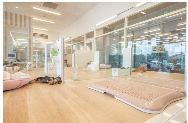
A large exercise space that looks comfortable for animals.

The flooring material is DEODORANT CLINSEF FT-1001.